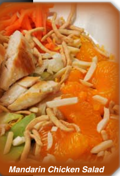
Mandarin Chicken Salad