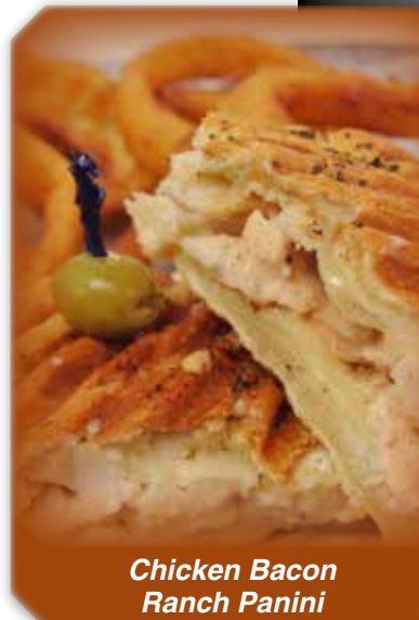
Chicken Bacon Ranch Panini

Select a 1/2 panini and cup of soup. 8.95